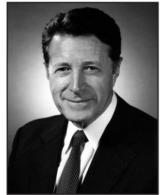
Caspar W. Weinberger

In 1979 "the Warsaw Pact outnumbered NATO by 3 to 1 in main battle tanks and artillery and 2 to 1 in tactical aircraft." (THATCHER, 1993, p.238) The Soviets based their military strength on quantity and were not prepared to compete against fewer but far superior weapons.