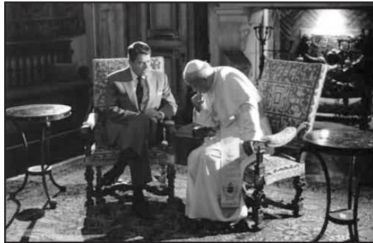
President Reagan meeting with Pope John Paul II in Miami, Florida. 9/10/87