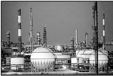
Since the 1980s, Saudi Aramco, the national oil company, had nine modern refineries that met the country's demand, and exported millions of barrels per day of petroleum products to countries around the globe

The international bankers had believed that the USSR stood behind any loans to the Eastern Bloc. Following Roger Robinson's advice, that theory was tested. The USSR's growing economic weakness was clearly exposed