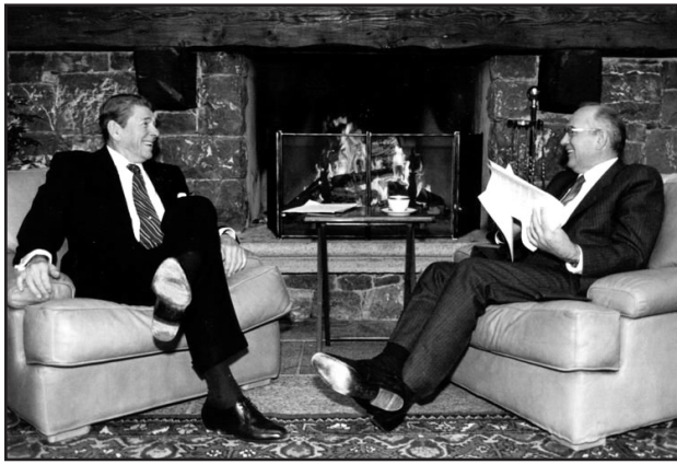
President Reagan and Soviet General Secretary Gorbachev at the first Summit in Geneva, Switzerland. 11/19/85

Since World War II, Soviet leaders had gained respect and prestige at home by meeting with Western leaders as moral equals. Reagan avoided letting them gain prestige this way.